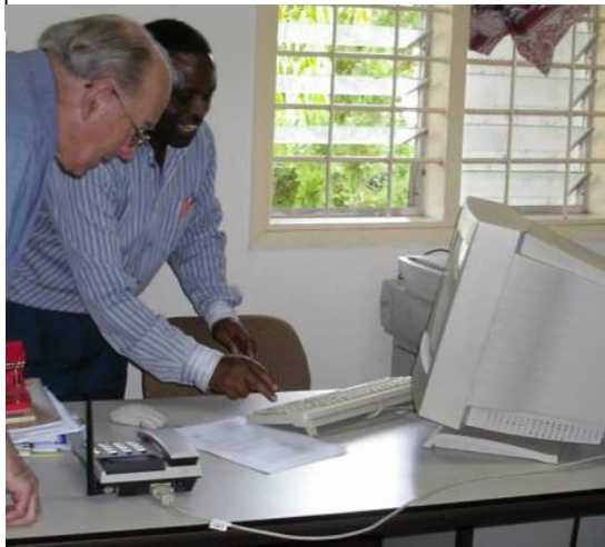
Left: the Internet connection at Buhuri, using the new mobile phone technology. We paid for this last year.

COMPUTERS: We continue to send an average of around fifty computers each year. Most of these go to schools. Many new secondary schools are being built by the Government and demand for computers will probably increase in the immediate future. If, for example, we send two or three to a school so that teachers can learn to use them, they will need twenty next year for students.